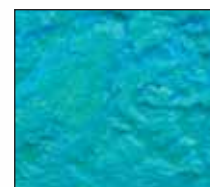
*AQUA BLUE (TURQUOISE)