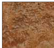
*ENGLISH RED (MAHOGANY)