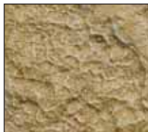
*GOLDEN WHEAT (AMBER)