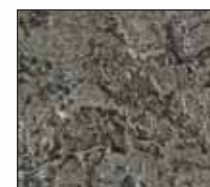
*ACID BLACK (EBONY)