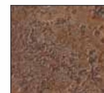
*VINTAGE UMBER (MISSION BROWN)

NOTE: STAIN COLORS WITH ASTERISKS (*) CORRESPOND TO POPULAR ACID STAIN COLORS.