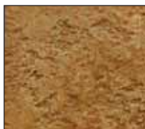
*MALAY TAN (CARAMEL)